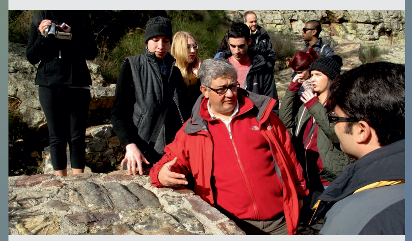
December 4th – Manchester Metropolitan University students in the Fossils Trail of Penha Garcia and the Boulders Trail of Monsanto.